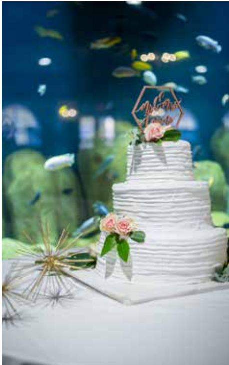
Malawi: Toledo Zoo & Aquarium