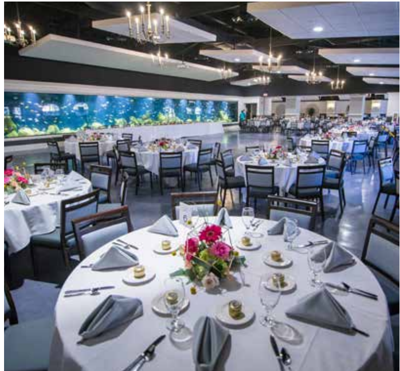
Malawi: Toledo Zoo & Aquarium