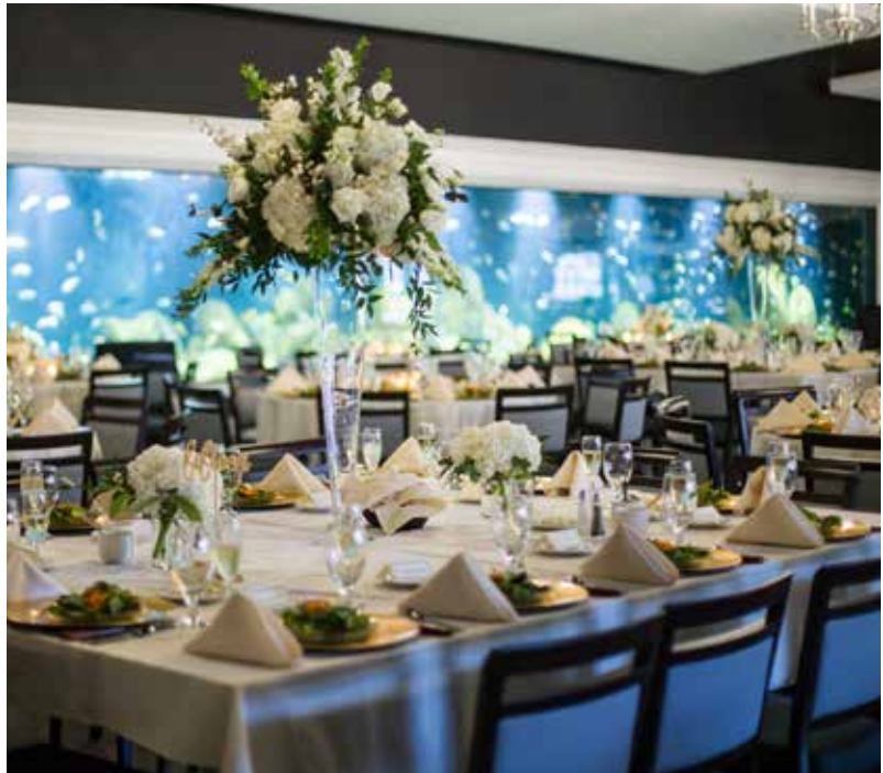
Toledo Zoo & Aquarium