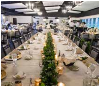
Malawi: Toledo Zoo & Aquarium

The Arctic Encounter® is the coolest place to host your wedding! Enjoy your special day surrounded by waterfalls, running streams, artificial rock and ice exhibits. Ask about having the polar bears out to play!