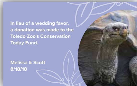
Sample favor card. Actual size is 2.5" x 3.5".

$2.50 per card 100 card minimum Assortment of animals and colors to choose from.